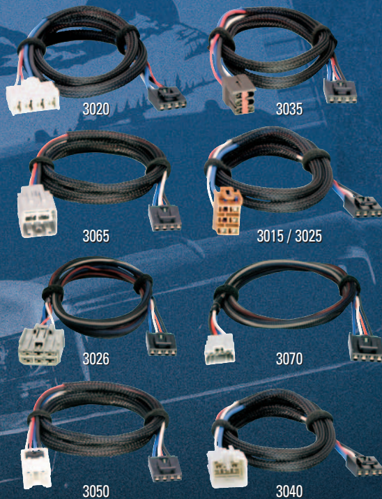
3034 (not pictured)